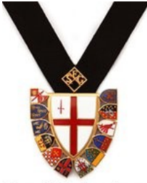
Financial Services Group of Livery Companies

The Financial Services Group of Livery Companies aims to support the Lord Mayor in his overseas visits, his meetings in the City with overseas delegations, and his role of promoting "the City" brand of UK financial and other business services. The Financial Services Group can act also as a gateway for those wishing to establish businesses in the City or who require professional and financial services in their country of operation. The FSG comprises: