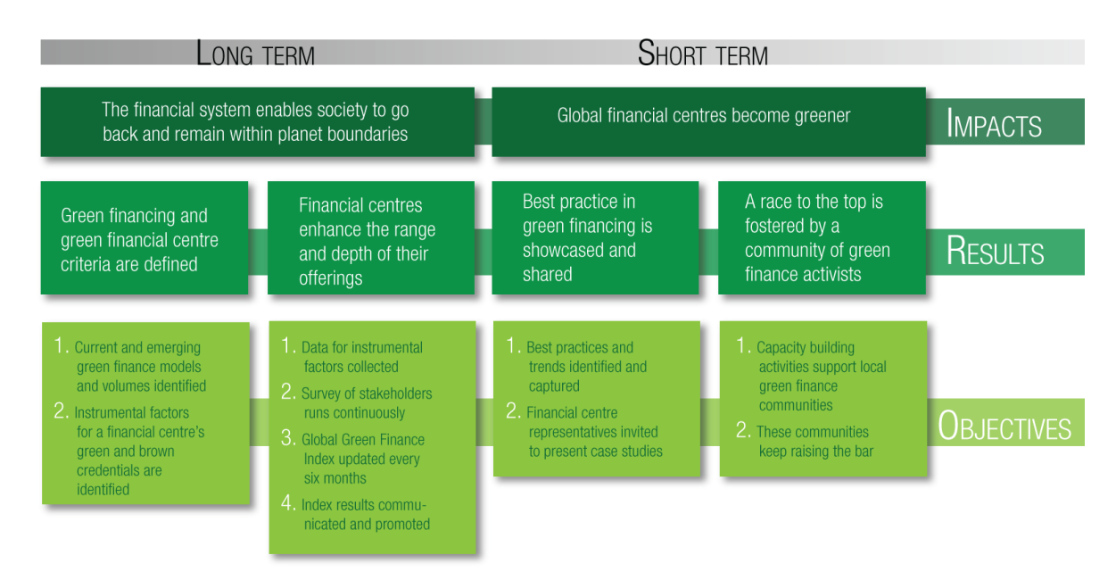
Figure 1: GGFI Aims and Objectives

4. The GGFI is published twice a year and uses qualitative ratings of financial centres' green finance credentials combined with a number of instrumental factors to create an index of financial centres according to their green finance performance.